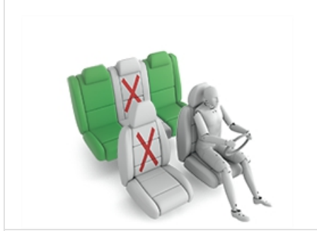
BeSafe iZi Kid X4 ISOfix (ISOFIX)