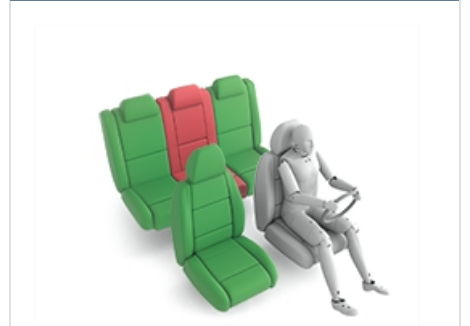
Römer King II LS (Belt)