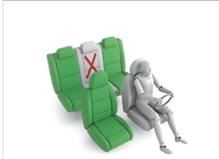
Maxi Cosi Cabriofix & EasyBase2 (Belt)